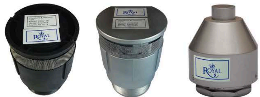
Pressure & Vacuum Vent