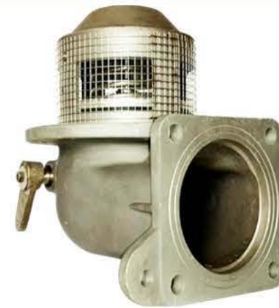
Bottom Valve Mechanical 3" (75mm)