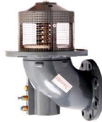
Bottom Valve Pneumatic 4" (100mm)