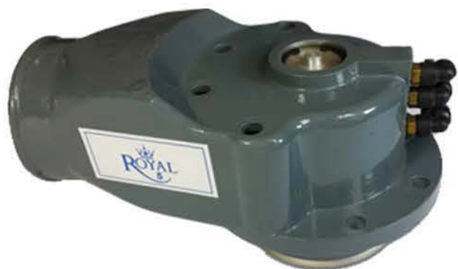
Vapor Recovery Vent