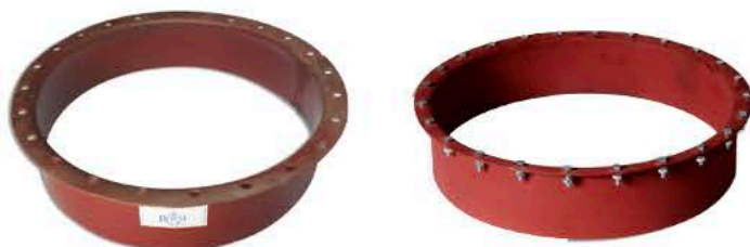
Weld Ring Manhole 16" & 20"