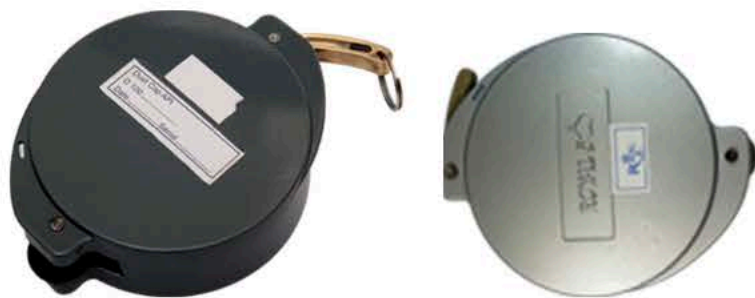
Dust Cap API Adaptor