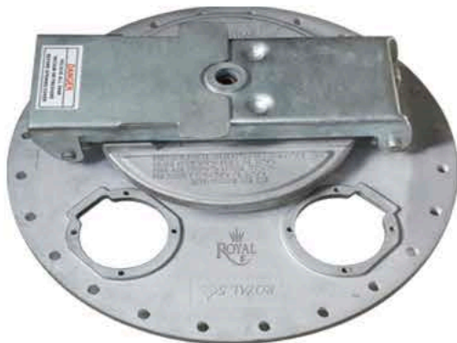
Manhole Cover 16" (460mm)