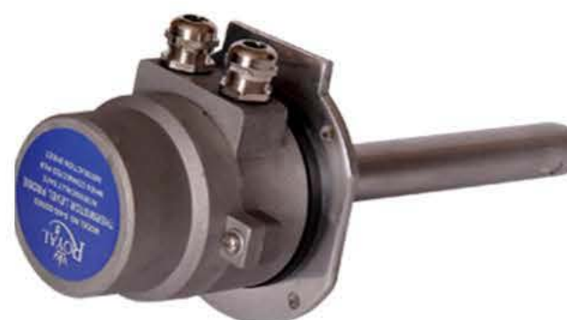
Overfill Sensor 2 & 5 wires