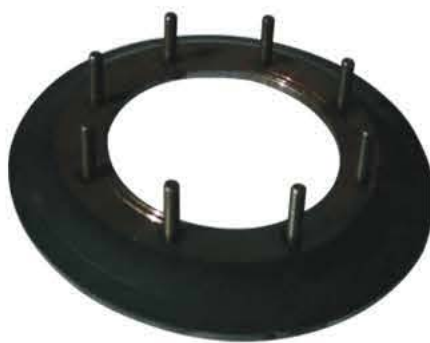
Mechanical Operator 1, 2, 3, 4 Lever