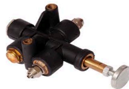
Brake Interlock on API