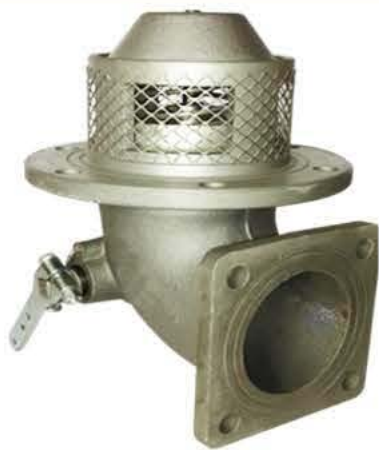
Bottom Valve Mechanical 4" (100mm)