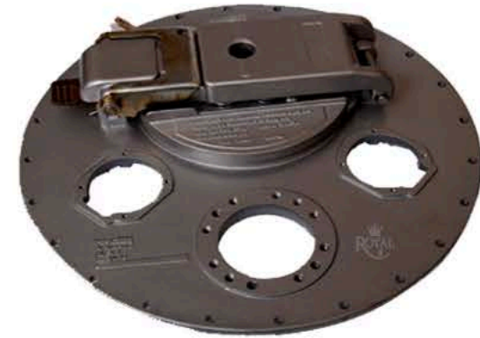
Manhole Cover 20" (500mm)