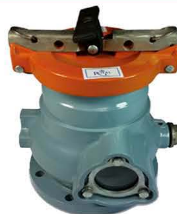
Vapor Recovery Adaptor