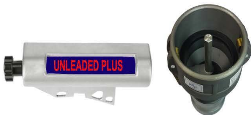
Product Indicators / Vapor Coupler