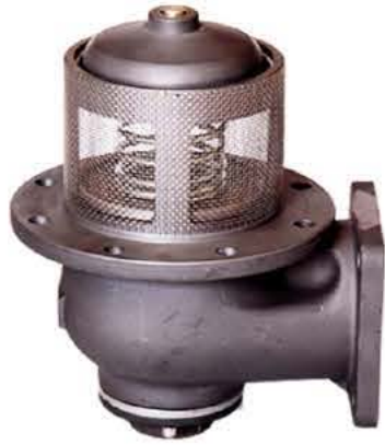
Bottom Valve Pneumatic 4" (100mm)