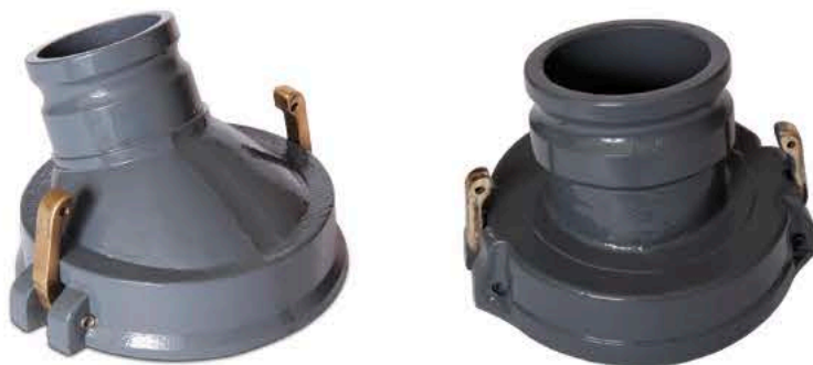
Gravity Discharge Coupler 3" & 4"