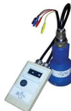
Tester with Coupler