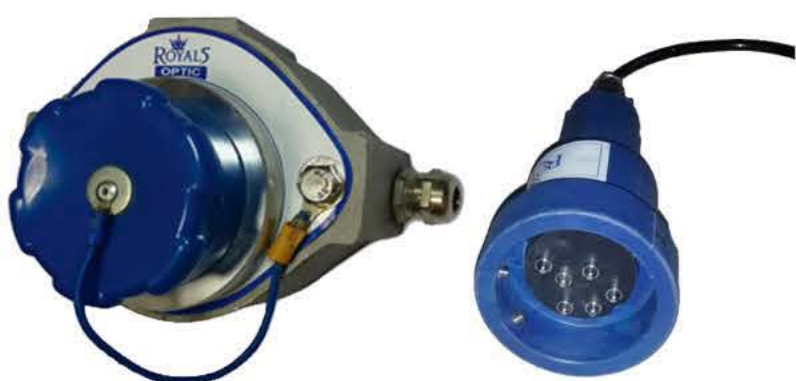
Manhole Cover 16" (460mm)