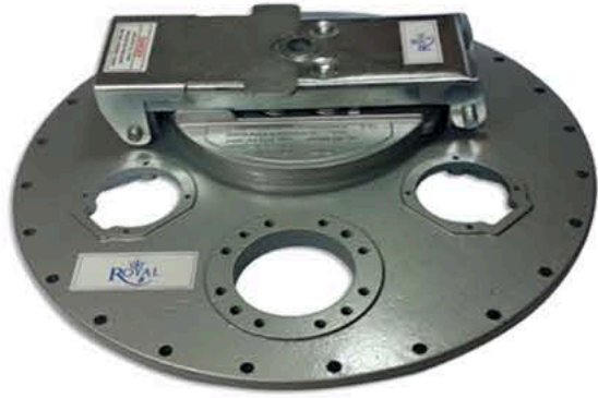
Manhole Cover 20" (500mm)