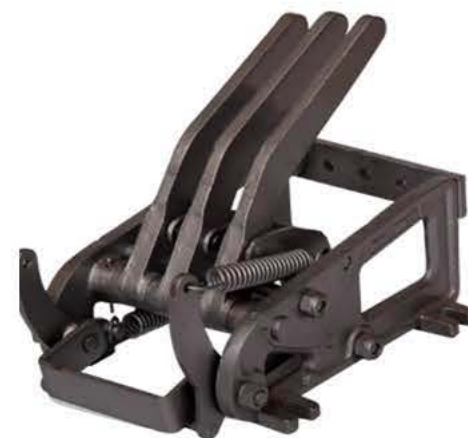
Sump Flange 3" (75mm) 4" (100mm)