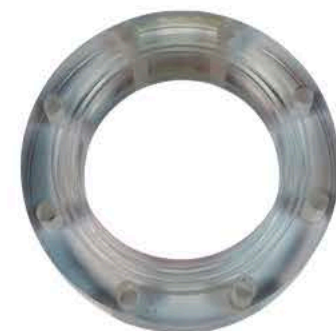
Sight Glass API Adaptor