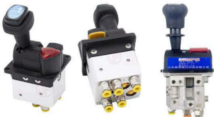
PTO Control Switch