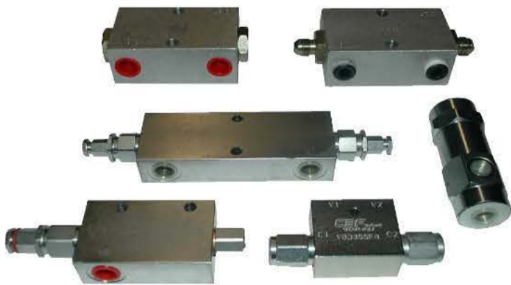
Hydraulic Lock Valve