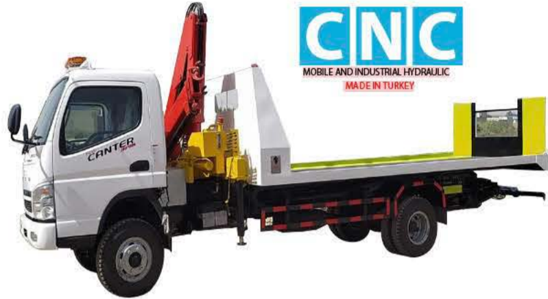
Recovery Truck Components