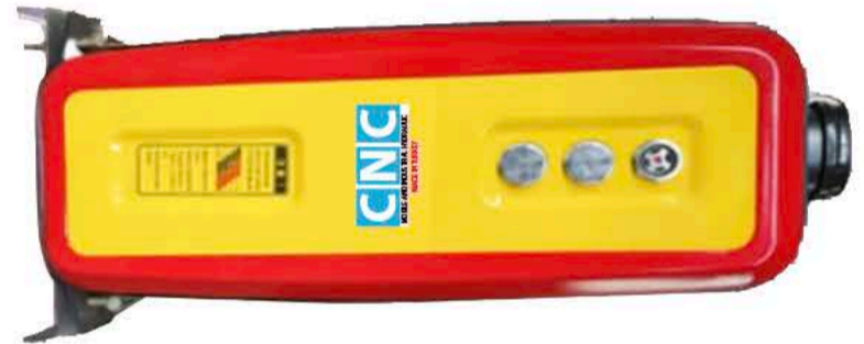
Hydraulic Oil Tank