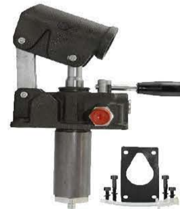
Hydraulic Hand Pumps