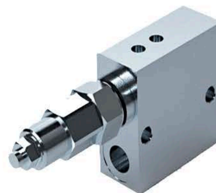
Flow Sequence Valve

Quality equipment from Turkey for Mini Tipper