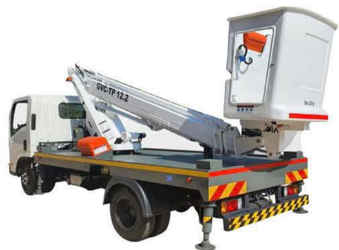
Aerial Plate Form