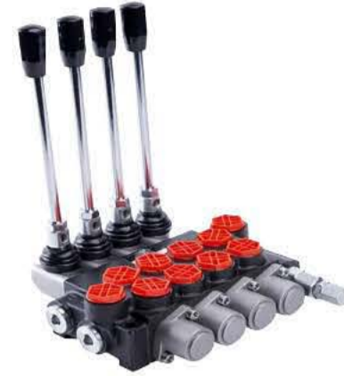
Monoblock Spool Valve