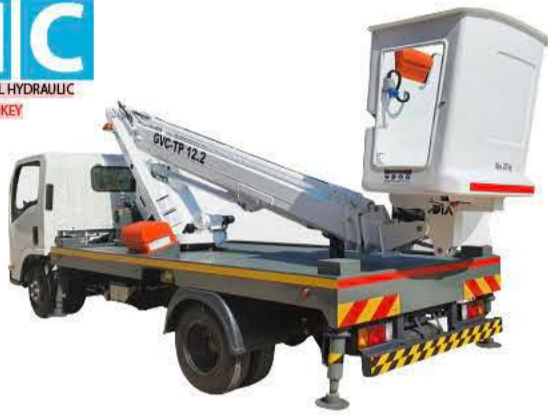
Aerial Plate From